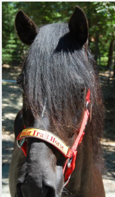
Halter awarded to Senior