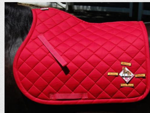
Saddle pad awarded to Master